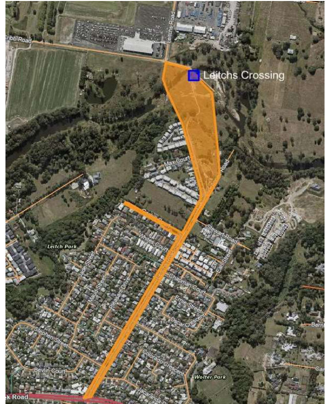
Leitchs Road South walking and cycling upgrade Investigation Area

This report outlines the engagement process undertaken and what we heard.